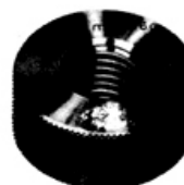
# 7803 - BSP - Go Ring