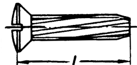
# 7513-G Oval Head